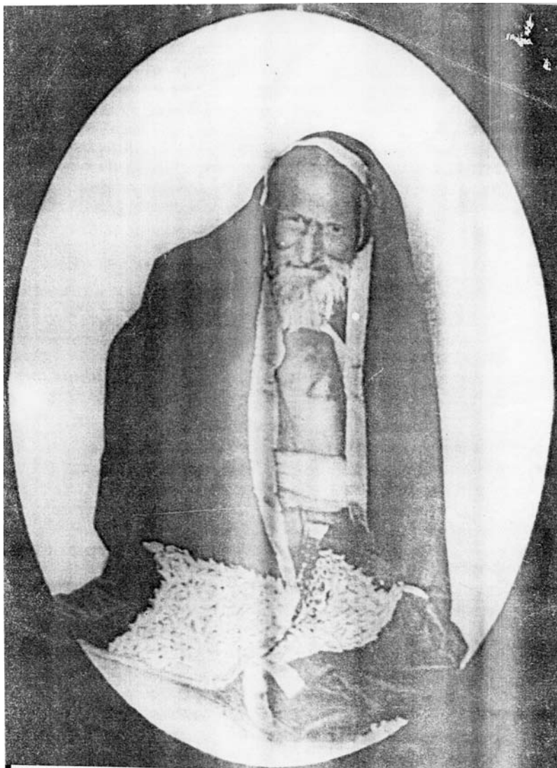
Figure 4 Banē Miyān, with gold-embroidered cloak, c. 1915.

recluse and miracle-worker. The effacing of Banē Miyān's early life in A'zam al-karāmāt was the price that was paid for his later sainthood – his transformation through mausoleum and hagiography from the faqīr 's flesh to the typological immortality of the saint. 23